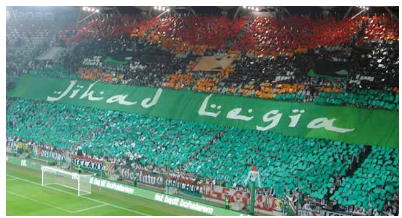
Legia Warsawa fans display a 'Jihad' banner to intimidate and abuse team Hapoel Tel Aviv players and dans during a Europa league game in September 2011

personal intervention of the Prime Minister, has brought in Never Again to help change the climate.