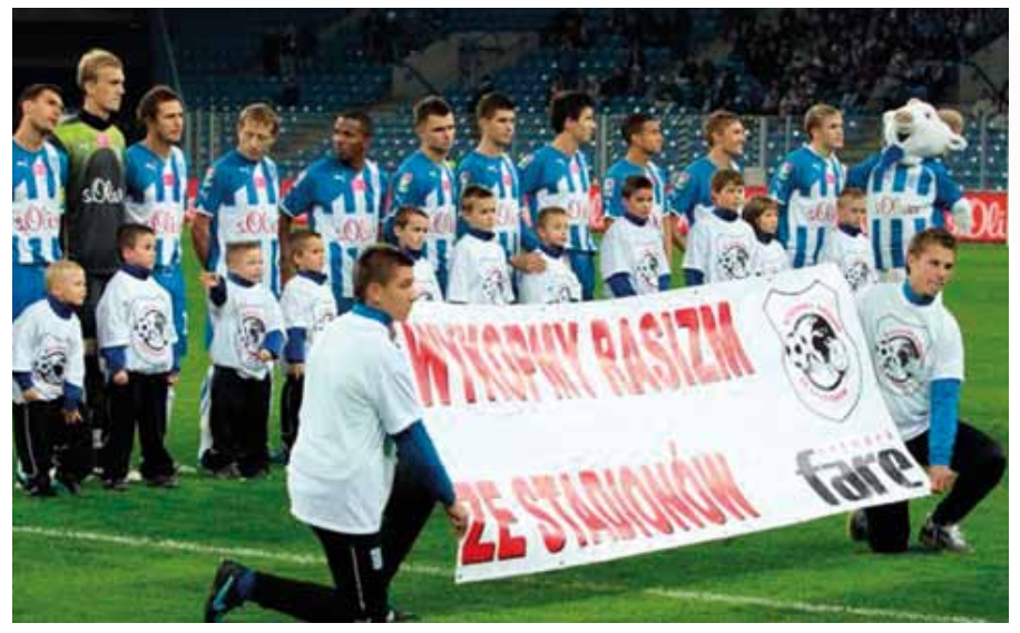
Anti-racism action organised by FARE's partner organisation Never Again in Poland, at this Ekstraklasa match between Lech

derby. The match began with the home Wisla Krakow fans displaying a huge banner behind the goal depicting a Wisla Shark stirring a boiling cauldron which clearly contained the body of a rival Cracovia fan.