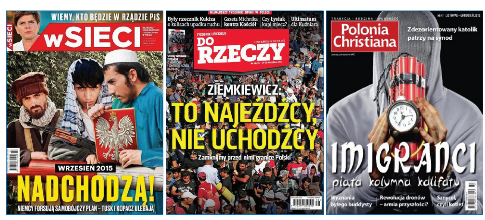
Figure 1: Covers of weeklies W Sieci ("They are coming") and Do Rzeczy ("They are invaders not refugees") and the bimonthly Polonia Christiana ("Immigrants - Caliphate's Fifth Column").

All these covers and many other similar images and statements made by the key politicians in the country resulted in the serious exaggeration of the threat and had also significant impact on the perception of the size of the Muslim community in the country. In line with the Thomas's theorem ("If men define situations as real, they are real in their consequences") — Poles defined the supposed inflow of Muslim as real although in reality it was not taking place, and thus produced significant increase of the size of Muslim population that was totally imaginary. The theorem suggests also that it is not only our thoughts that are affected by our perception of the social reality but also our deeds. The interpretation of a situation in the country as the "Muslim invasion" and attack on "our culture or our way of life" quickly caused also certain supposedly "defensive actions" (see below subchapter Verbal and Physical Attacks).