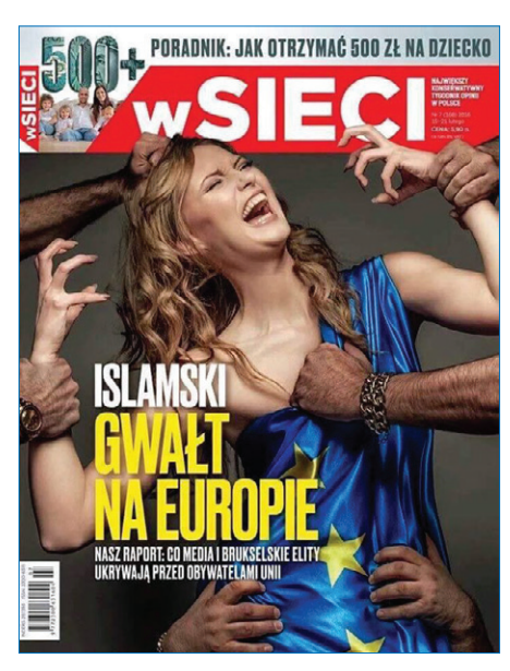
Figure 3: February 2016 cover of the magazine W Sieci - "The Islamic Rape of Europe".

This type of narrative was strengthened by more nuanced articles by central and leftwing mass media outlets, which however maintained the same "clash of civilization" and anti-Muslim logic. Importantly they were also strengthened by the statements of the country's key politicians. The Minister of Foreign Affairs Witold Waszczykowski wrote a letter to his German counterpart demanding information whether there were Polish women among the victims of the attacks. Earlier in a TV interview commenting on the New Year's Eve attacks he argued that the so-called "refugee crisis" has been used by the DAESH and other terrorist organisations "to fight with our civilisation on our land".39