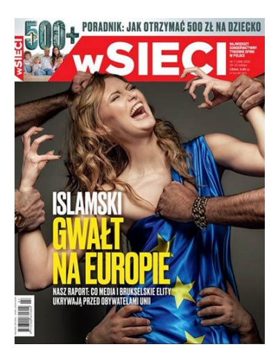
Figure 4: w Sieci featured headline 'The Islamic Rape of Europe'