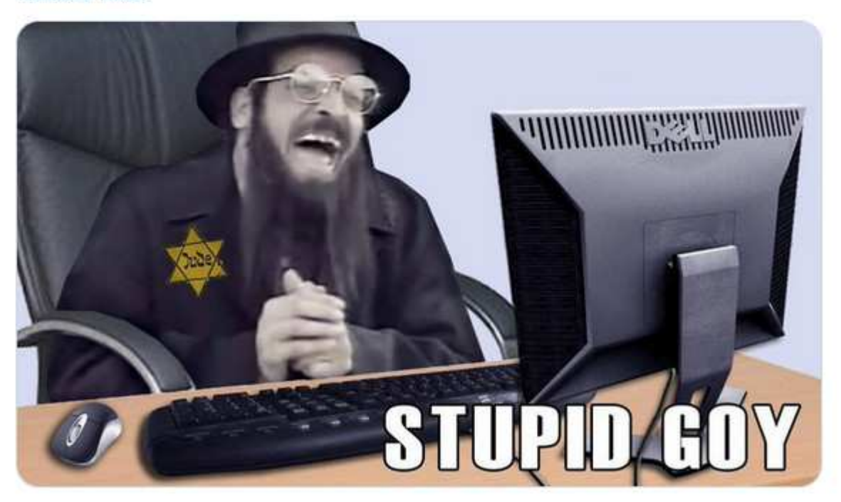
2:30 AM · Jul 29, 2019 · Twitter Web App

Mikke has called for lowering the age of consent for children as, "There are girls who are 12, 13, and completely mature."