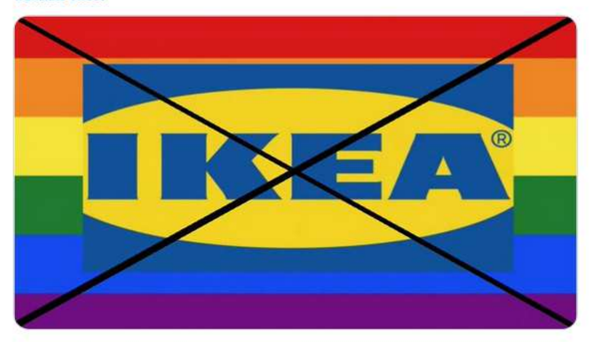
10:55 AM · Jul 18, 2019 · Twitter Web Client